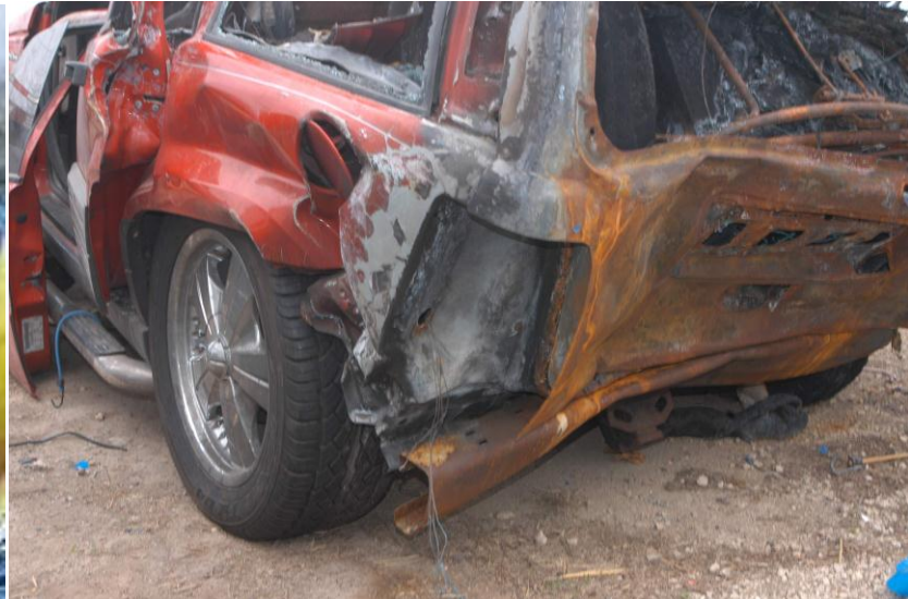
Jarmon Family 1993 Jeep Grand Cherokee with Trailer Hitch

A police investigation into the Jarmon crash “concluded that the gas tank had been punctured by the Jeep’s trailer hitch.” 1 Chrysler confidentially settled litigation over the Jarmon crash which focused on the trailer hitch rupturing the tank.