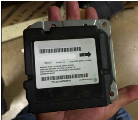
Figure 1. An Event Data Recorder