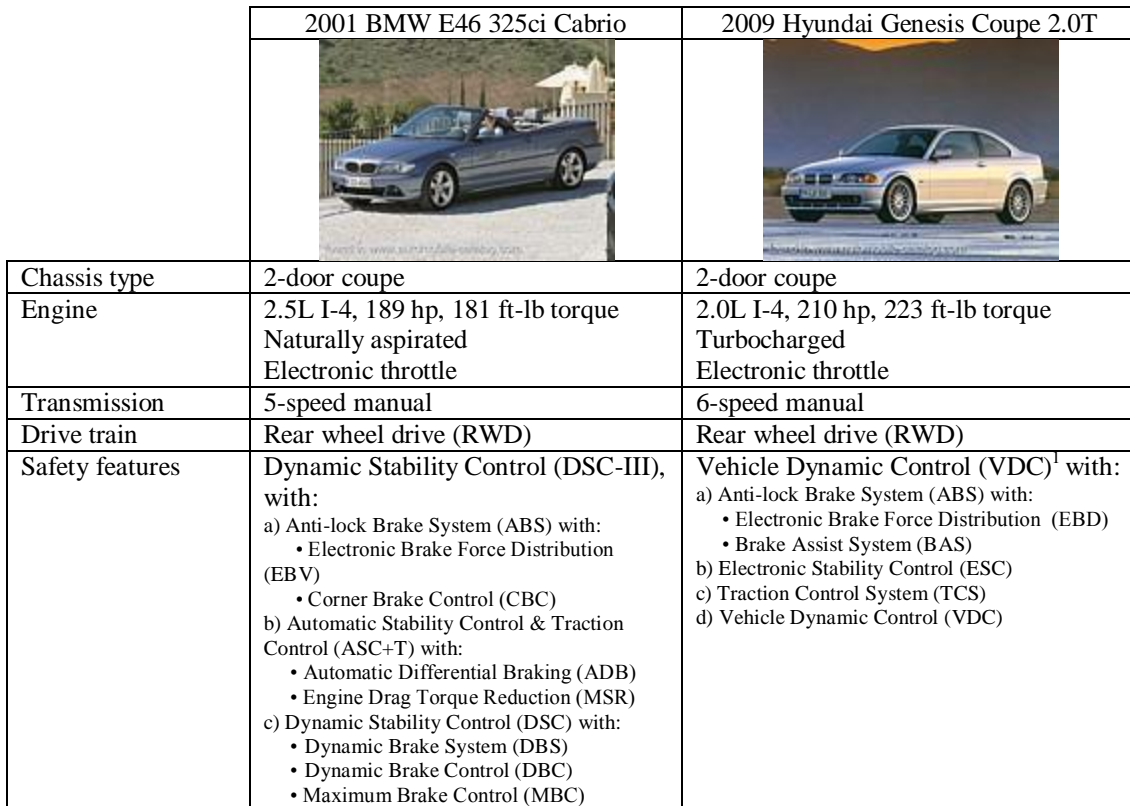
Table 1. Key features of the two vehicles exhibiting this unusual form of unintended acceleration.

Even though both of these vehicles had electronic throttles, it turned out that the unintended acceleration was not caused by the electronic throttle. It was caused by the wrong size tires.