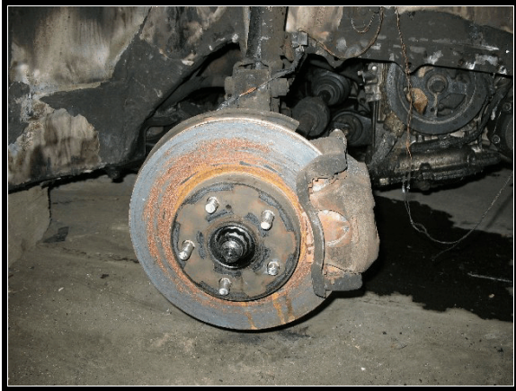
Figure 20. Right front rotor