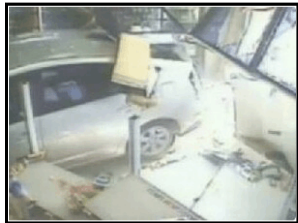
Figure 6. Toyota Prius inside convenience store (in-store camera)