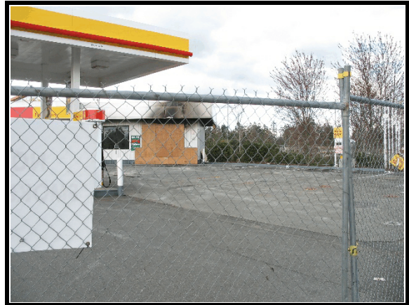
Figure 5. Impact with convenience store (fencing not present at time of crash)

The case vehicle was initially traveling north on an interstate highway. The driver indicated that he had recently purchased the vehicle. According to the driver, two dealers had inspected the vehicle with no issues reported and one had certified it. The last location the vehicle was fully stopped was approximately 16 km (10 miles) from the crash site. As the driver was returning from the dealership, the driver indicated that he took his foot off the accelerator and the vehicle continued without slowing. The driver stated that he began braking, but every time he took his foot off the brake the vehicle would accelerate back up to 121 km/h (75 mph). The driver indicated that he continued riding the brake to keep the vehicle under control. He stated that there was heavy traffic on the interstate and that it was necessary to dodge traffic at various points. He exited the interstate using an off-ramp on the right side. The light at the end of the off-ramp was green and the driver continued through the cross street and entered the parking lot of a convenience store.