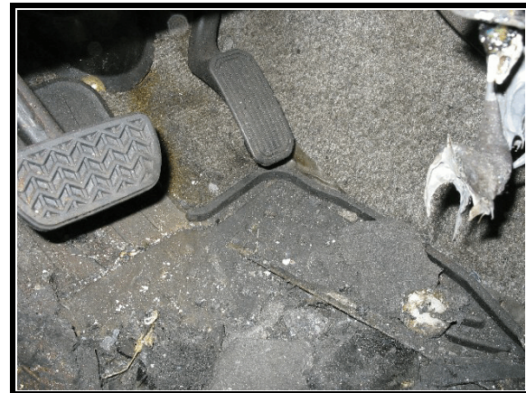
Figure 17. Pedal/mat before pressing pedal