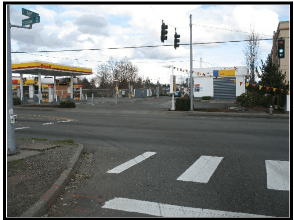
Figure 4. Case vehicle entering cross street at end of ramp