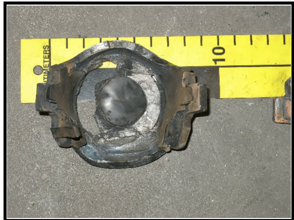
Figure 25. Left front inner pad