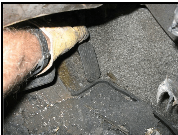
Figure 18. Pedal pressed down, trapped by mat