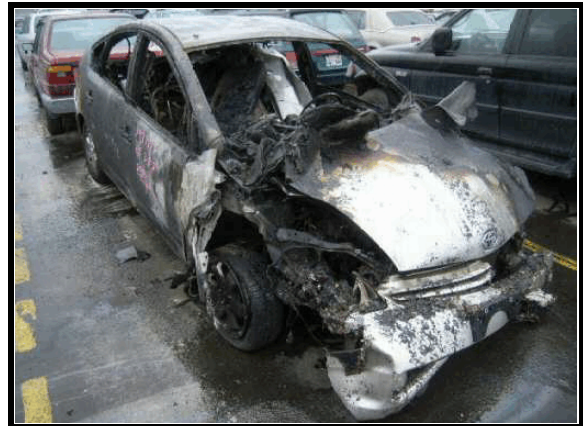
Figure 1. Front right, 2005 Toyota Prius

This single vehicle crash occurred in March 2007 at 1245 hours. The crash occurred on private property just beyond an interstate off ramp. The case vehicle was a 2005 Toyota Prius driven by 66-year-old male. The driver indicated that he had recently purchased the vehicle. As he was returning from the dealership, the driver indicated that the vehicle began accelerating. The driver stated that he applied both the service brakes and the parking brake, but the vehicle would not stop. The vehicle left the initial roadway, traveled down an off ramp and eventually entered the parking lot of a convenience mart store. The vehicle continued on and struck the convenience mart with its front end. The vehicle penetrated the store. A clerk was temporarily pinned behind a counter. The vehicle then caught on fire. The fire department arrived shortly after the crash. They put out the fire but were concerned by the high voltage system and the possibility of electrocution. After the fire was put out, fire inspectors contacted a local automobile dealership who then sent a service technician to the site to deactivate the power leads for the rear traction battery 1 by pulling the battery service plug. The driver of the case vehicle was able to exit the vehicle under his own power. He did not sustain any injuries.