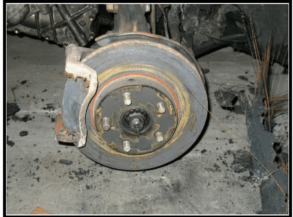
Figure 21. Left front rotor