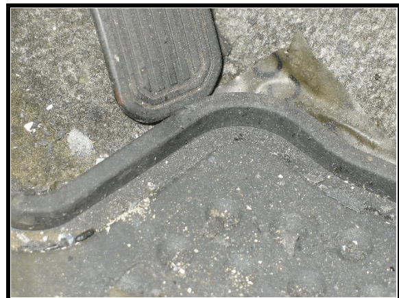
Figure 19. Close up. Pedal pressed down, trapped by mat