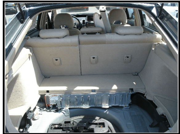
Figure 13. Exemplar view of battery access with cover removed