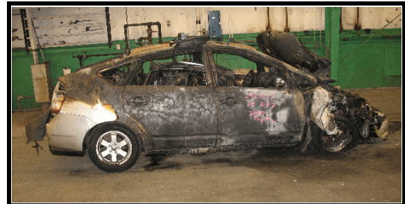
Figure 8. Right side view, Toyota Prius