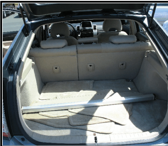
Figure 12. Exemplar view of battery access with cover in place