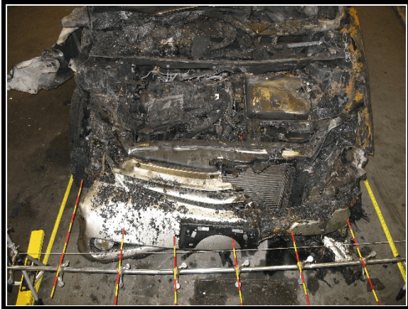
Figure 10. Overview of engine compartment