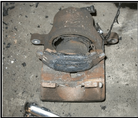
Figure 22. Front right inner pad