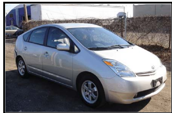
Figure 2. Exemplar vehicle, 2005 Toyota Prius

This hybrid vehicle ODI case was identified by NHTSA from an on-line news video. DSI was assigned the case on March 8, 2007. DSI located the vehicle on March 11, 2007 and obtained permission to inspect the vehicle on March 12, 2007. Field work was conducted during the week of March 19, 2007. A second vehicle inspection took place later in the month to remove and inspect the vehicle brakes. The driver also filed a Vehicle Owners' Questionnaire (VOQ) report under ODI 10209497 in November, 2007.