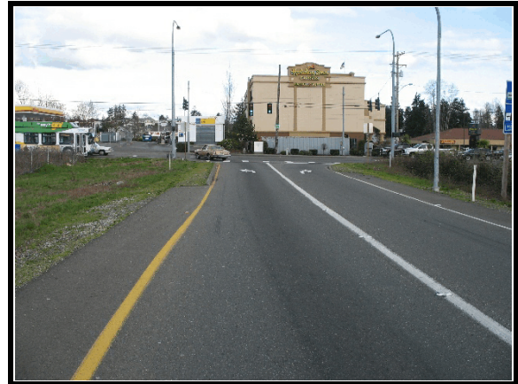
Figure 3. Case vehicle traveling down off ramp (east)

At the time of the crash, there were no adverse weather conditions and the asphalt roadway surface of the off ramp was dry.