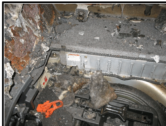
Figure 15. Service plug location on case vehicle