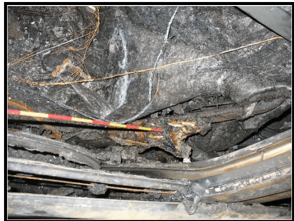
Figure 27. Driver's seat back mounted side air bag