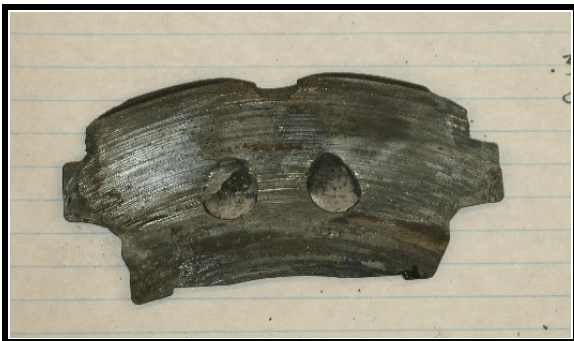
Figure 24. Front right outer pad