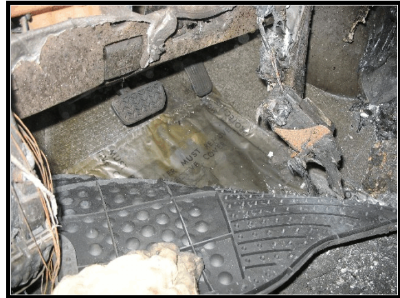
Figure 16. Plastic sheet on top of floor carpeting

The front brakes were removed and examined by the DSI investigator. All the brake pads exhibited wear that was consistent with the brakes being applied for a long period of time while the vehicle was at speed. The brake pads were worn down to the metal. There were also indications of excessive temperature.