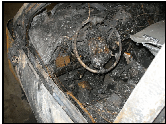
Figure 26. Driver's air bag

The 2005 Toyota Prius was equipped with dual-stage frontal air bags for the driver and front right passenger positions. The Prius was also equipped with seat back mounted side air bags. According to the driver, there were no air bag deployments as a result of the impact with the building.