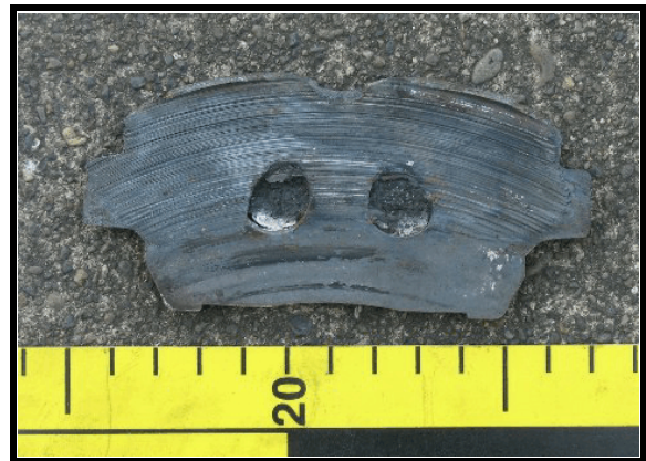
Figure 23. Left front outer pad