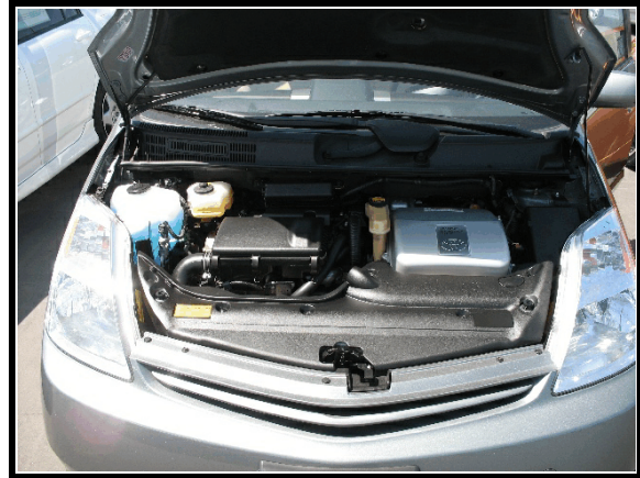
Figure 11. Exemplar view of engine compartment