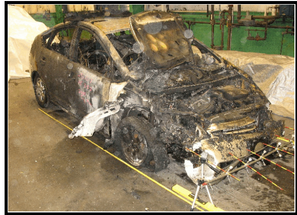
Figure 7. Front right, Toyota Prius

The Prius sustained burn damage on all planes. It appears likely that the heat generated by the continual brake application may have been the source of the fire. All the glazing on the vehicle was gone. All the doors were closed. They could not be opened because all the handles/grips had been carbonized in the fire and were totally frangible and broke away when any pressure was applied. The doors were later pried open by this investigator.