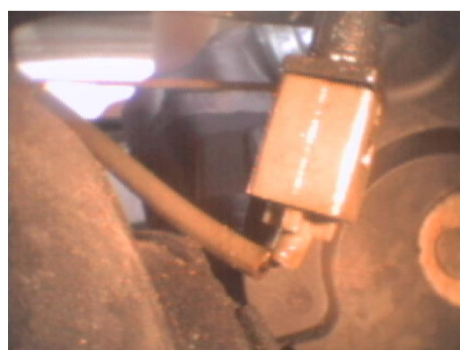
Borescope Pictures of Bloom Escape

Most recalls do not involve deaths. This one does. Ford itself has reported that claims have been filed against the company in 41 cases where a death or injury is alleged to have occurred from a defect in the vehicle speed control of a Ford Escape with 35 of the 41 claims involving a 2002-04 Escape. The 41 claims involve 42 injuries and 4 deaths with the 2002-04 Escape accounting for 35 injuries and all 4 deaths. (Attachment A.)