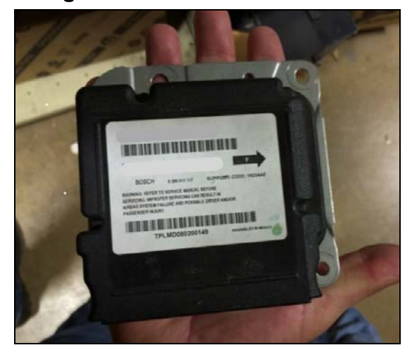
Figure I. An Event Data Recorder