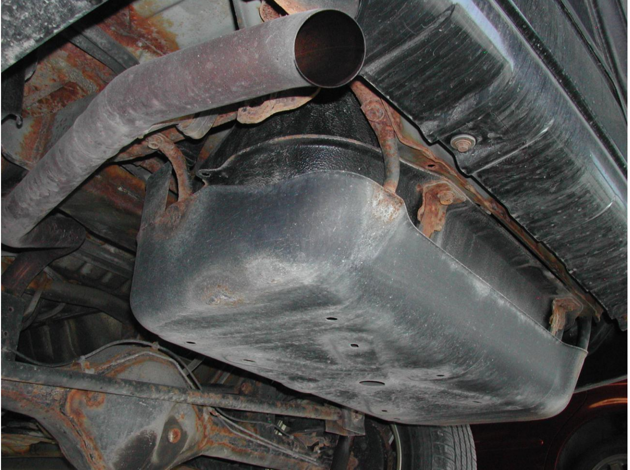
Exhibit A – Encapsulated Suzuki SL-7 Fuel Tank