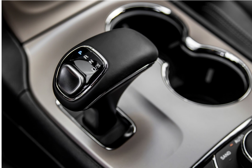
Figure 1. Monostable gearshift, 2014-15 Jeep Grand Cherokee.