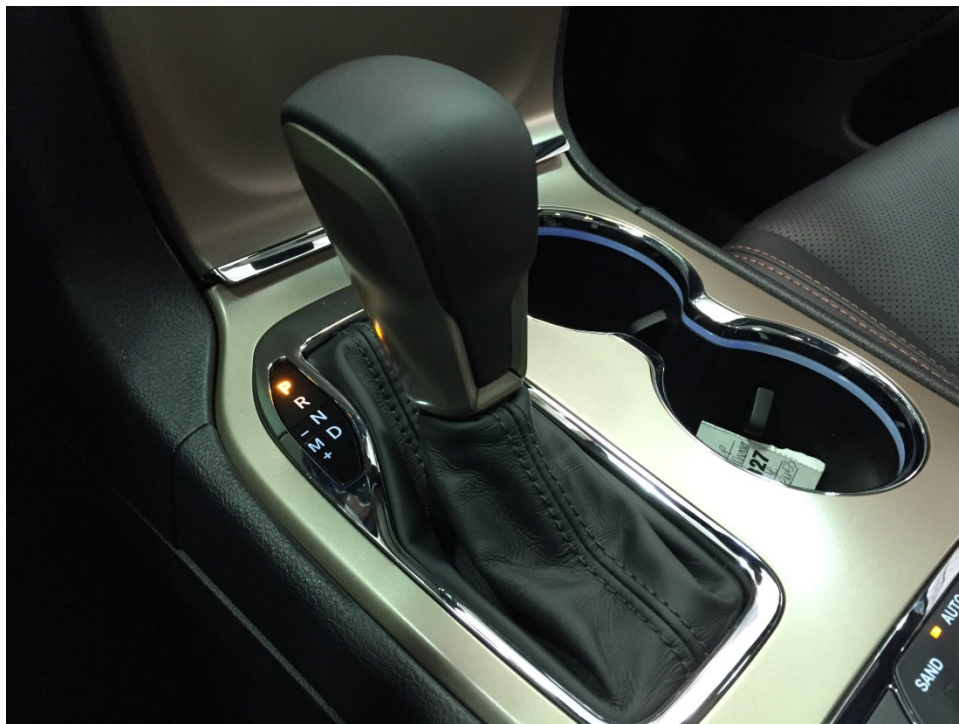
Figure 2. Polystable gearshift, 2016 Jeep Grand Cherokee.