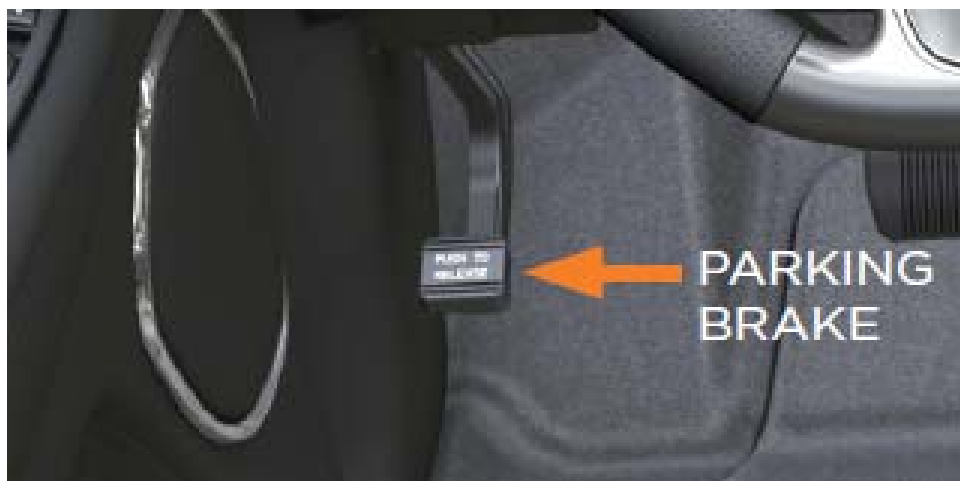
Figure 3c. Parking Brake.