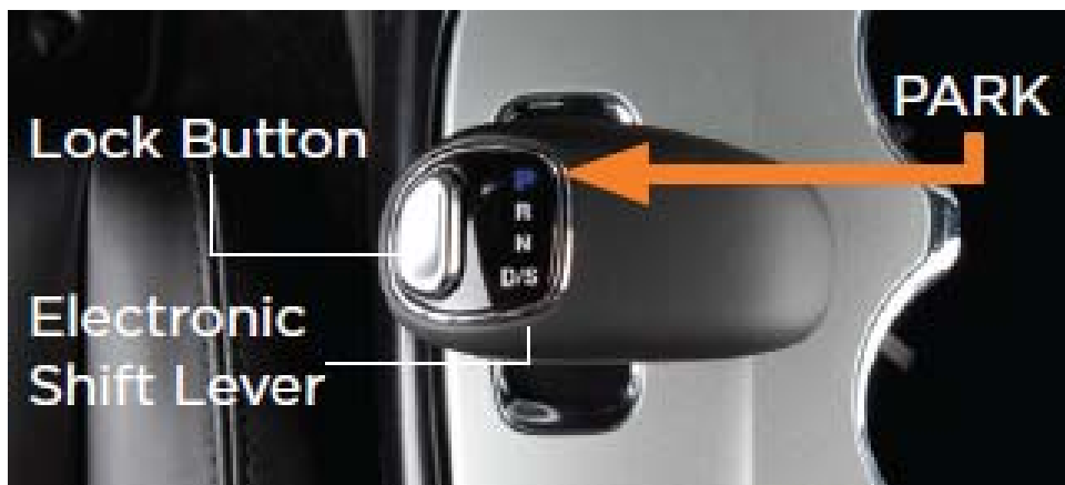
Figure 3b. Monostable Gearshift, Gear Position Indication.